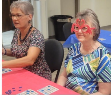
Our volunteers really get into a good game of bingo!