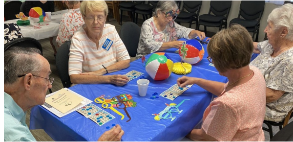
Some of you take this game pretty seriously...Just saying...