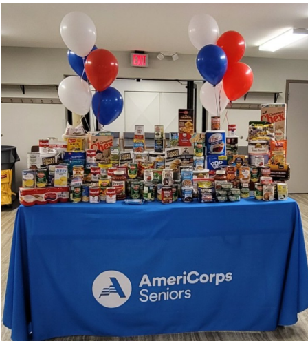
Food donations to the Christian Service Center, from the Abilene RSVP Volunteers and the Concho Valley Council of Governments