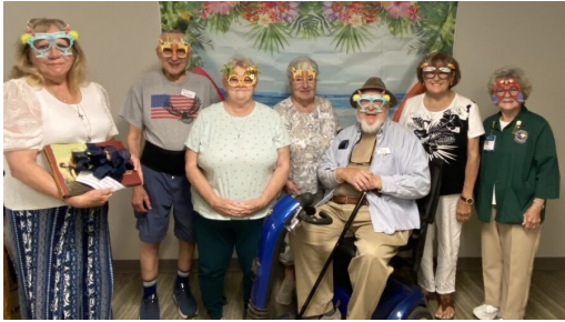
Bingo Winners, also known as the “Wild Beach Bunch”