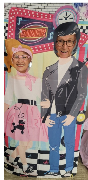
Volunteers with hearts full of smiles!