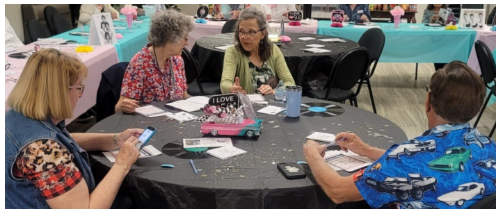
Luncheons are a great place to catch up on all volunteer news!