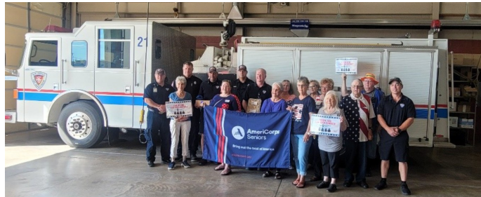
Patriots' Day 9-11-2025 San Angelo