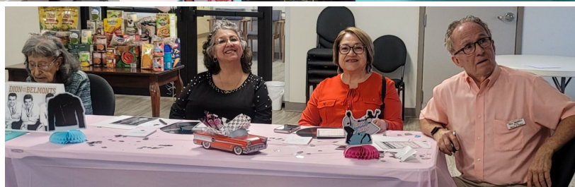
Smiles from Meals on Wheels, Plus!