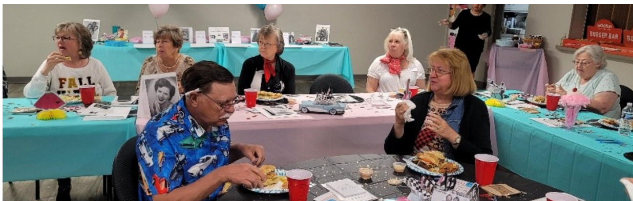
Mooyah Burgers...perfect match for the 1950's theme!